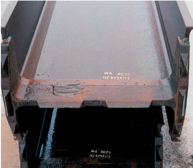
Driving shoes protect the pile toe from damage when hard soil layers are expected during driving