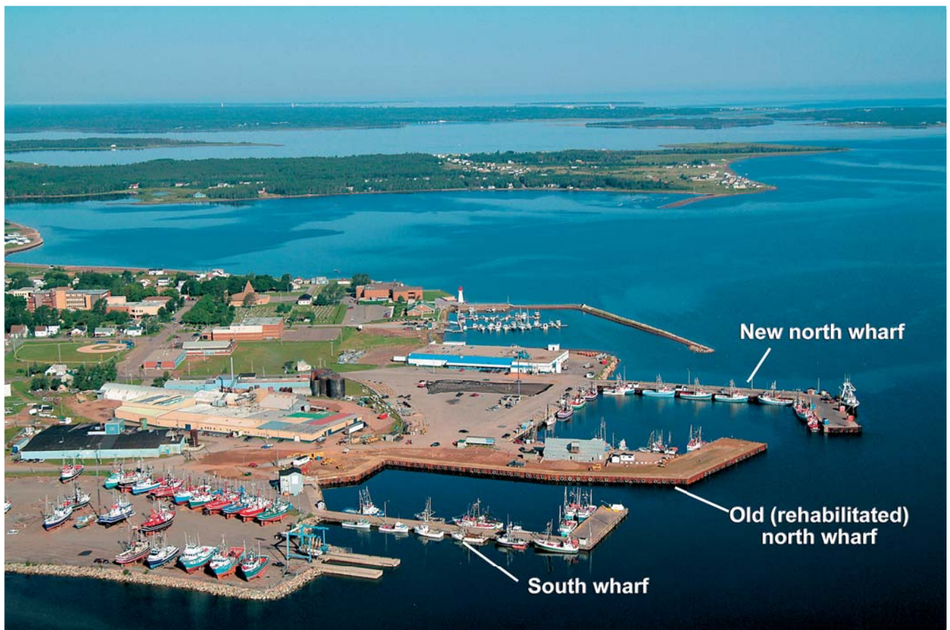
Shippagan harbour showing the old and new north wharves on either side of the inner dock

The proposed project comprised construction of a new quay wall, backfilling, and finishing of the deck.