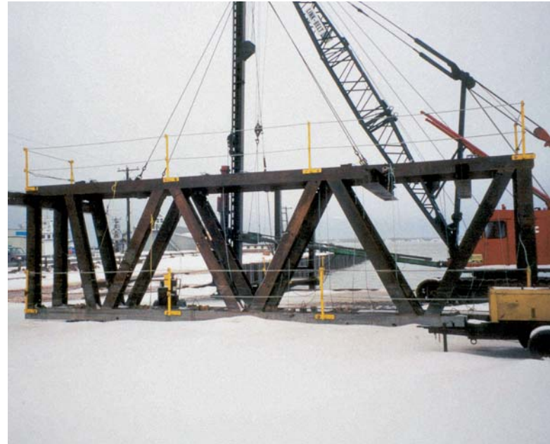
The two-level template ensures the king piles are correctly positioned for driving

A Delmag D19-32 diesel impact hammer was placed on the existing wharf to drive the steel sheet piles through the top soil layers and into the hard mudstone. Pre-drilling was not necessary despite tough soil conditions. Special “driving shoes” produced by APF in New Jersey, USA protected the HZ piles from damage during the driving process. The contractor Comeau & Savoie Construction Ltd built a two-level template in their workshop to facilitate the installation of combined sheet pile walls. The design of the template was based on conceptual drawings supplied by Arcelor adapted to accommodate the driving shoes.