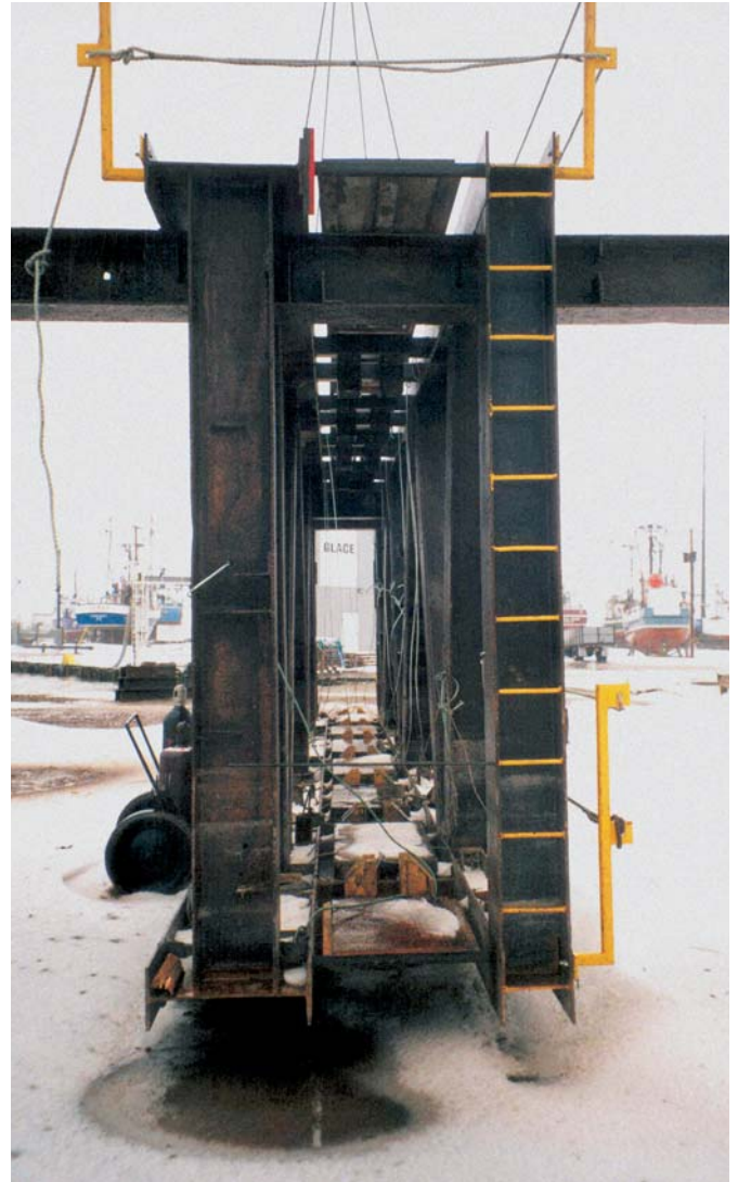
Eight guiding shoes – four per template level – guide each HZ king pile

After the installation of the combined-wall system, the contractor proceeded with placement of the concrete tie-back blocks, installation of the tie rods, backfilling between existing and new structures and, finally, installation of a concrete and asphalt wharf deck.