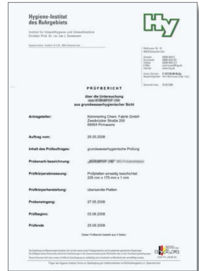
Test report MSP-1

"Considering the fact that [MSP-1] remains effectively embedded within the sheet pile interlocks for typical applications, we believe that an appreciable impact on water in contact with the structure can be ruled out."