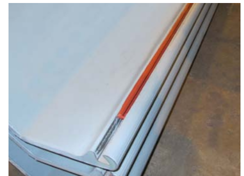
MSP-1 product extruded into the interlock