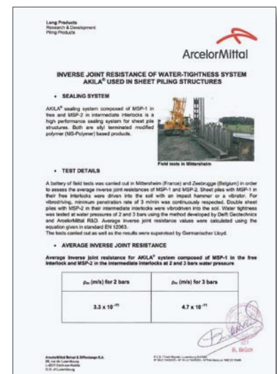
Certified test report